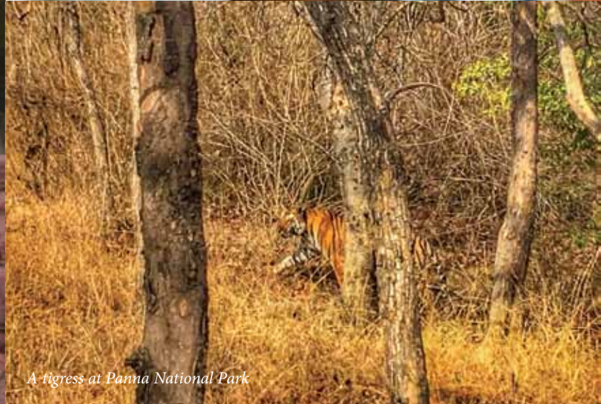
A tigress at Panna National Park