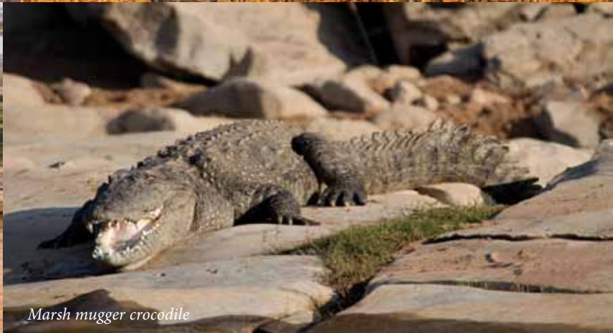
Marsh mugger crocodile