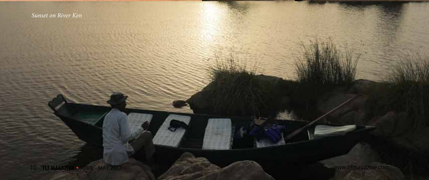
Sunset on River Ken