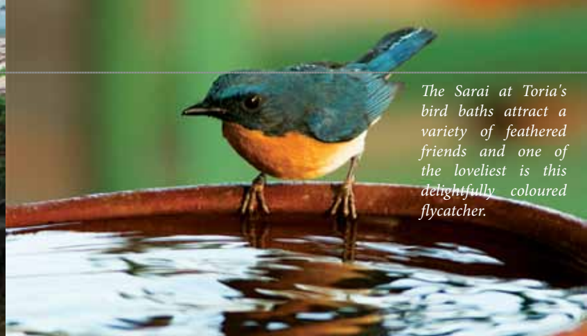
The Sarai at Toria's bird baths attract a variety of feathered friends and one of the loveliest is this delightfully coloured flycatcher.