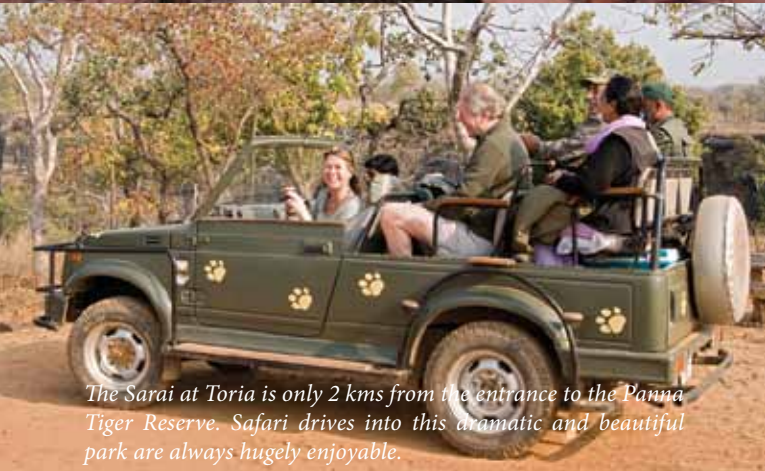
The Sarai at Toria is only 2 kms from the entrance to the Panna Tiger Reserve. Safari drives into this dramatic and beautiful park are always hugely enjoyable.