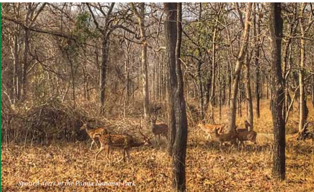
Spotted deer in the Panna National Park

There are a plenty of options in India, the Himalayan meadows and peaks, the tropical beaches, North Eastern towns, Western dunes and so on, but in the heart of India lies a treasure trove of history and nature, awaiting to be relished!