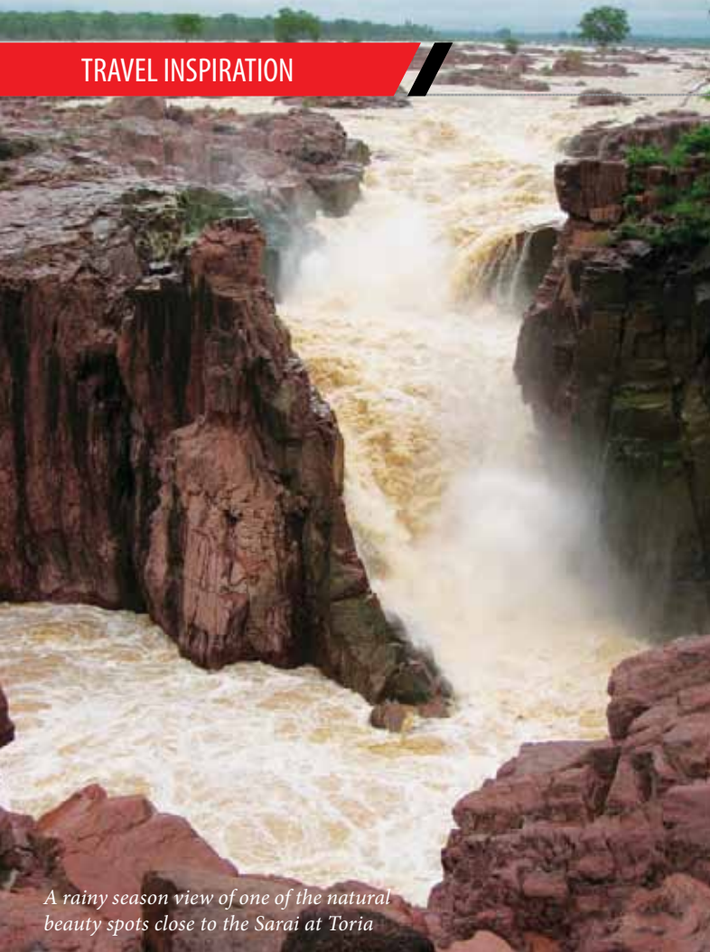
A rainy season view of one of the natural beauty spots close to the Sarai at Toria